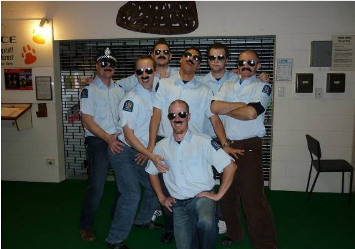
The Papakura Police. By the way they looked when they arrived there were going to be no arrests that night!