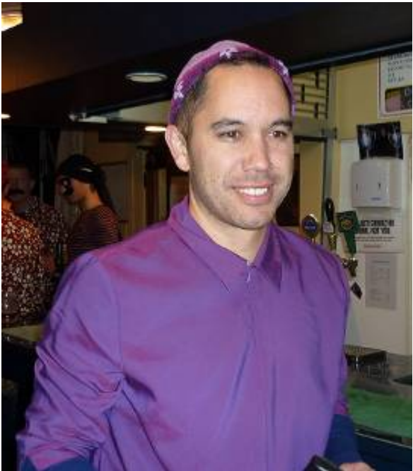
A handsome Purple Look Another Pimp Daddy?