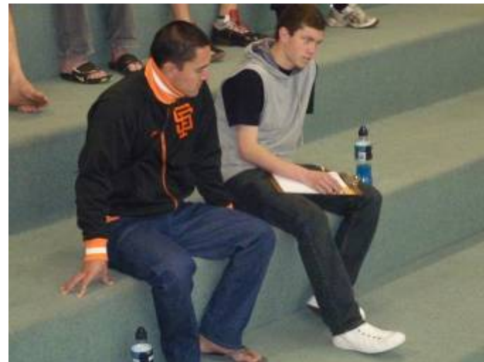
Left....Are the Herne Bay hierarchy sussing out their line of attack for next year's Cousins Shield?!